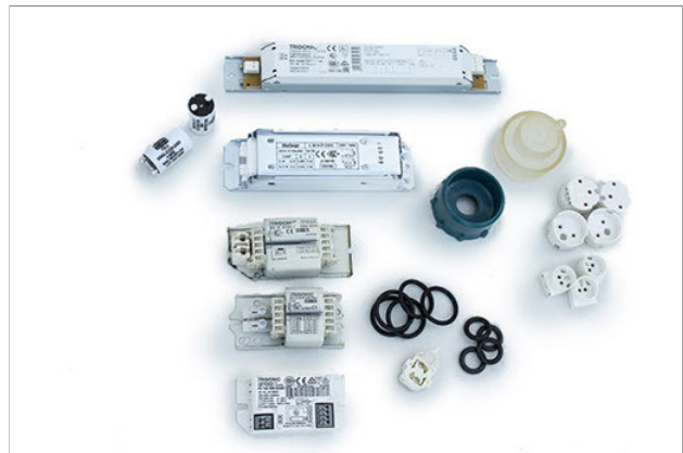
UV Sterilizer Parts